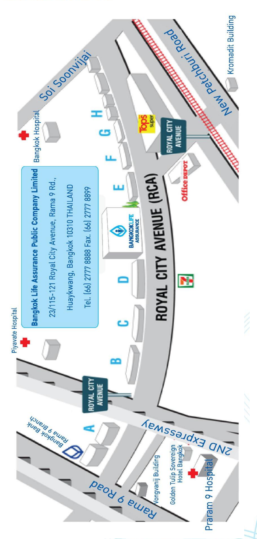
Map of the Annual General Meeting of Shareholders Venue